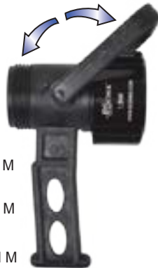
PG1515 Pistol Grip with Shut Off 1 1/2" NH Full Time Swivel x 1 1/2" NH M