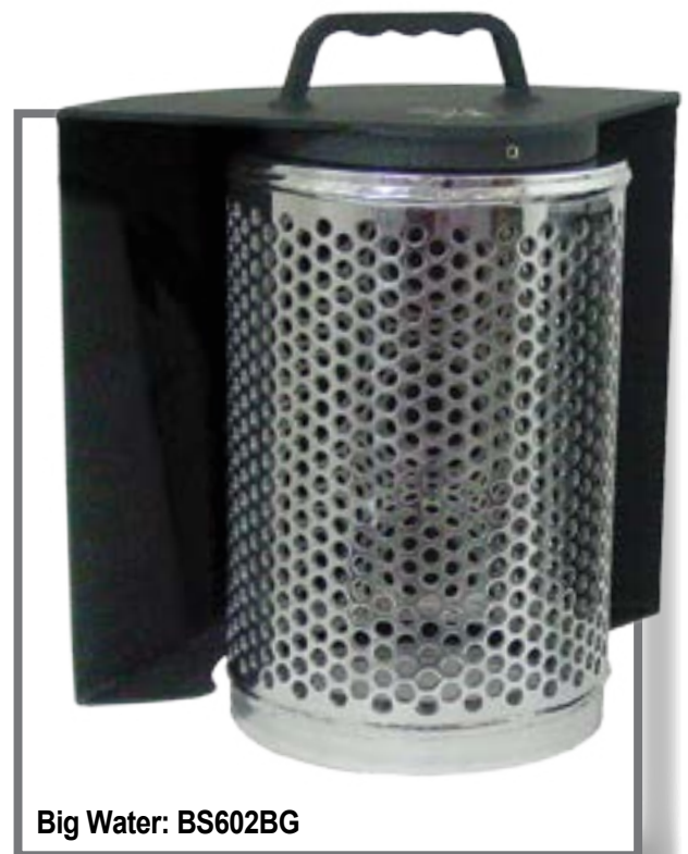
Big Water: BS602BG