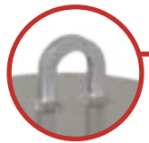
"U" for Easy Lanyard Connection