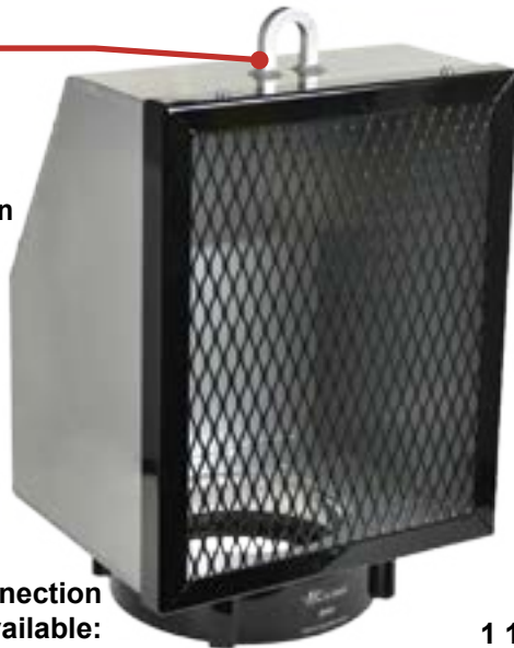
NH Connection Sizes Available: 1 1/2", 2 1/2", 3", 4", 4 1/2", 5", 6"