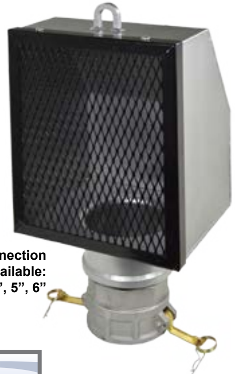
Camlock Connection Sizes Available: 1 1/2", 2 1/2", 3", 4", 5", 6"