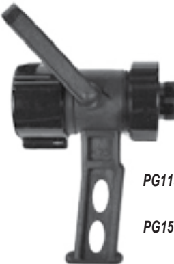
PG11 / PG115