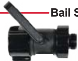
BV11 Bail Shut Off 1" NH Full Time Swivel x 1" NH M BV115 Bail Shut Off 1" NH Full Time Swivel x 1 1/2" NH M BV1515 Bail Shut Off 1 1/2" NH Full Time Swivel x 1 1/2" NH M