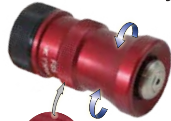
NZ008 1" NPSH 10 to 25 GPM