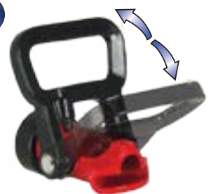
NZ027 Adjustable Fan Stream Nozzle Bail Handle creates either a Wide Band or Smooth Bore reaching distances up to 80 ft.