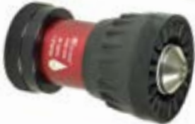
NZ012 1.5" NPSH 20 to 60 GPM