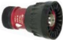
NZ009 1" NPSH 10 to 24 GPM