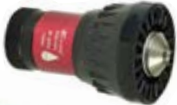
NZ015 1" NPSH 20 to 60 GPM