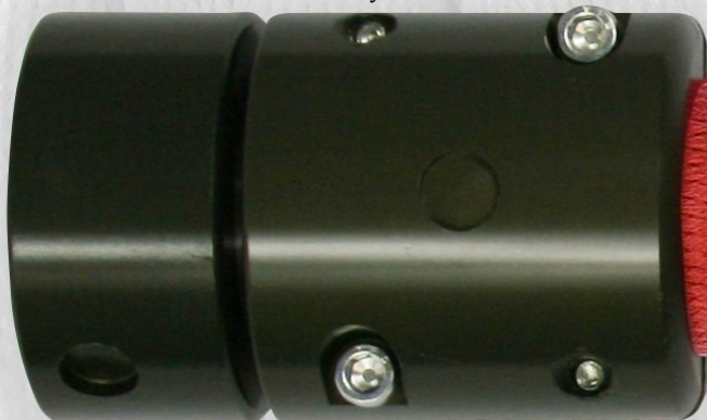
Optional Field Repairable Coupling